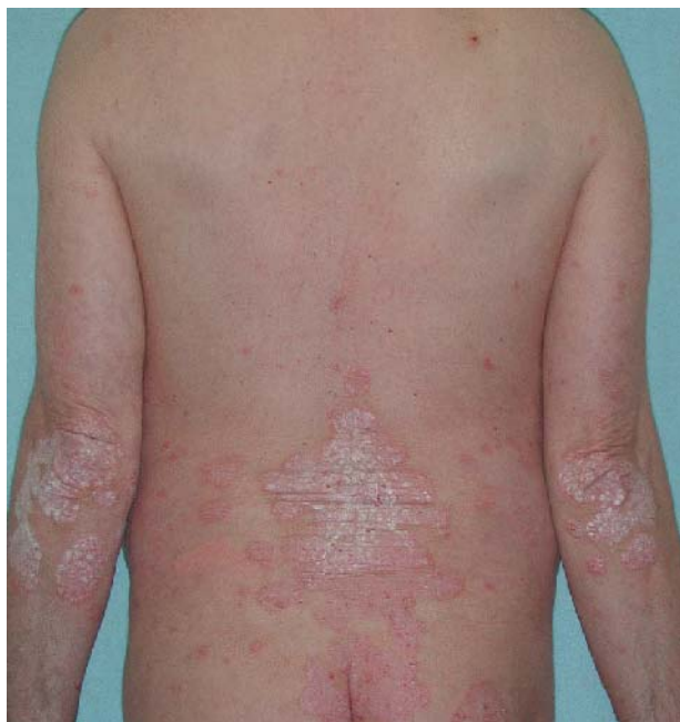
Figure 1 Symmetrical distribution of psoriatic lesions on the back and elbows.

various types and presentations of psoriasis are outlined below.