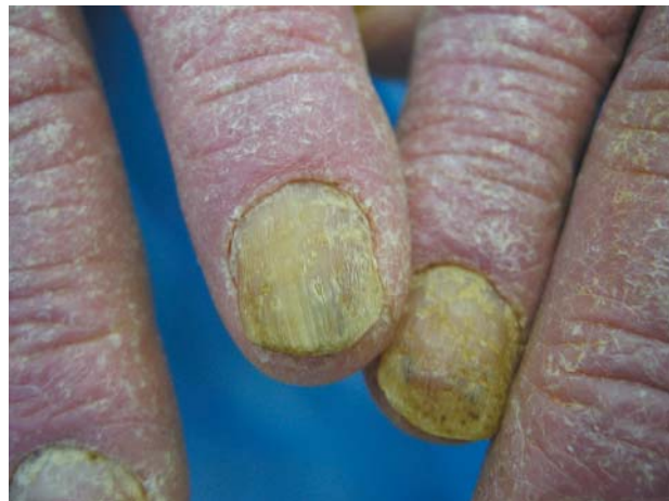
Figure 5 Nail plates in a patient with psoriasis. They are thickened, dystrophic, and show orange-yellow areas (oil spots).

everyday disability leading to depression and suicidal ideation in more than 5% of patients. 28