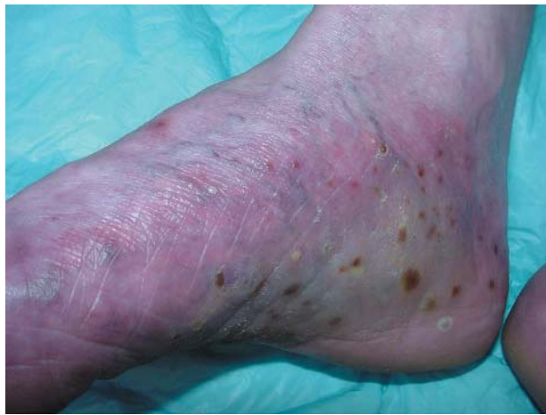
Figure 3 Palmoplantar pustulosis.