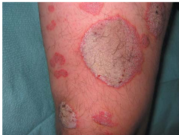
Figure 2 Nummular (coin-sized) lesions of psoriasis.

Guttate psoriasis, from the Greek word gutta meaning a droplet, describes the acute onset of a myriad of small,